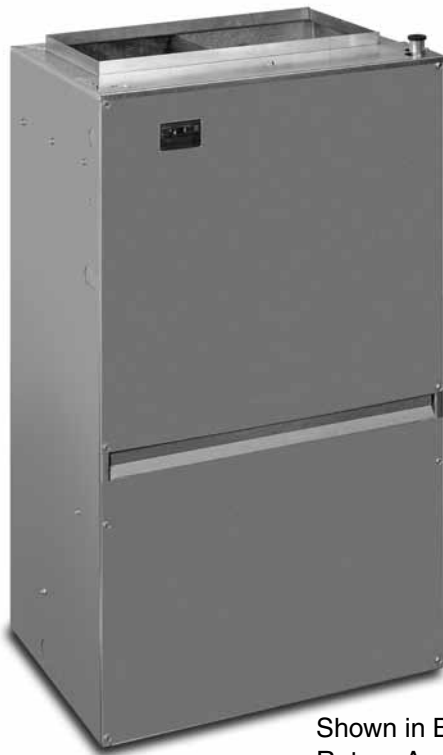
Shown in Bottom Return Application

The GB5BW Series air handler, when combined with our heat pump or air conditioner, offers a full line of quality, split system heating and cooling equipment.